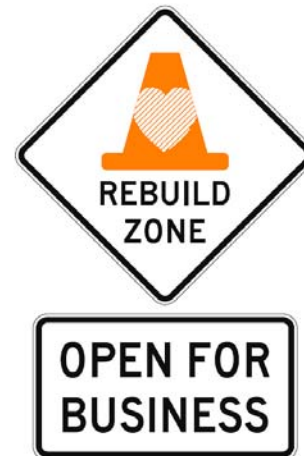
CBD Catchment Perimeter sign

SCIRT and CTOC have developed the concept further, and resolved some technical details around the onsite installations. Signage installation will commence next week (from 9 th December), and should be completely installed by Christmas.