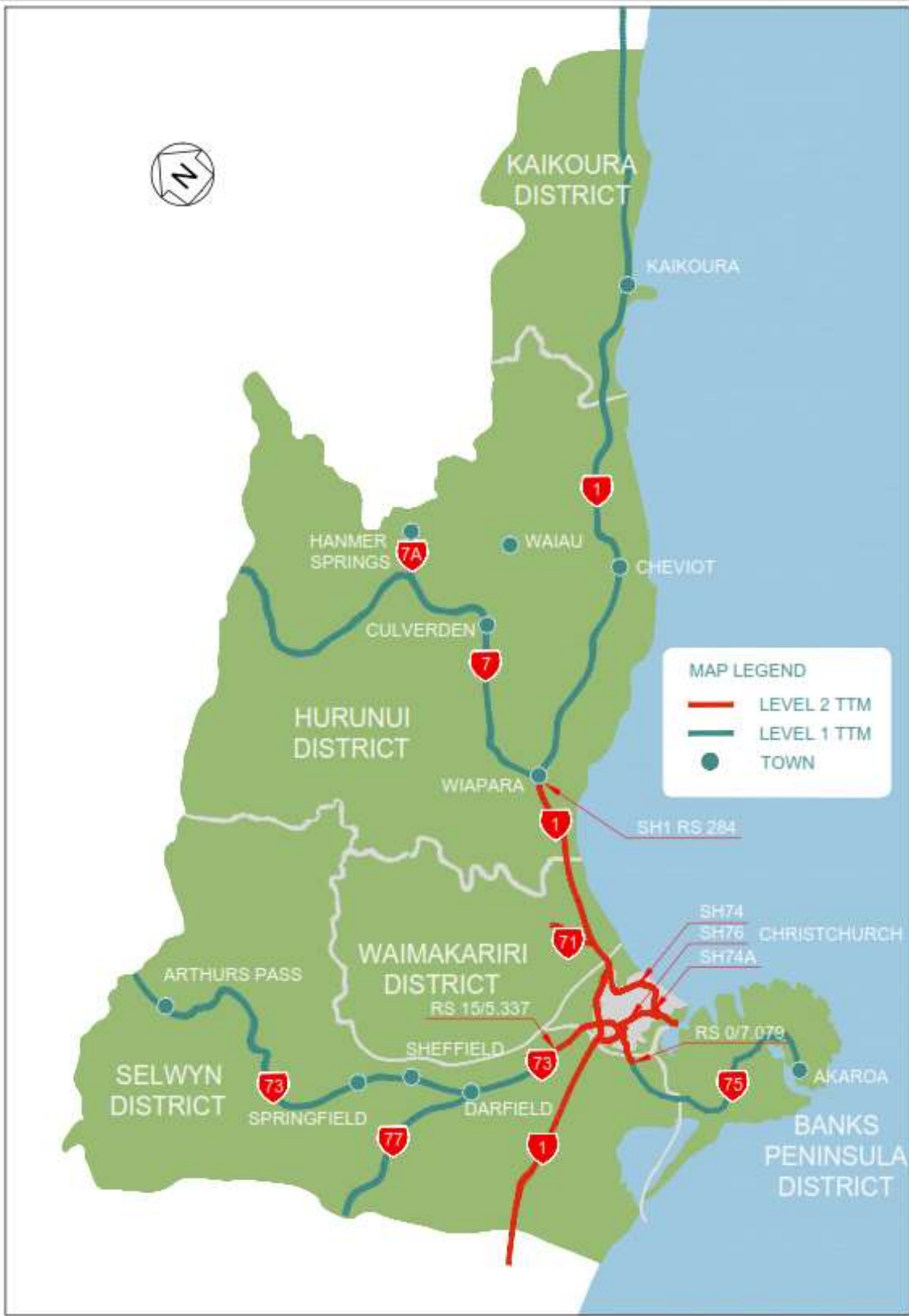
NORTH CANTERBURY STATE HIGHWAY TRAFFIC MANAGEMENT LEVELS