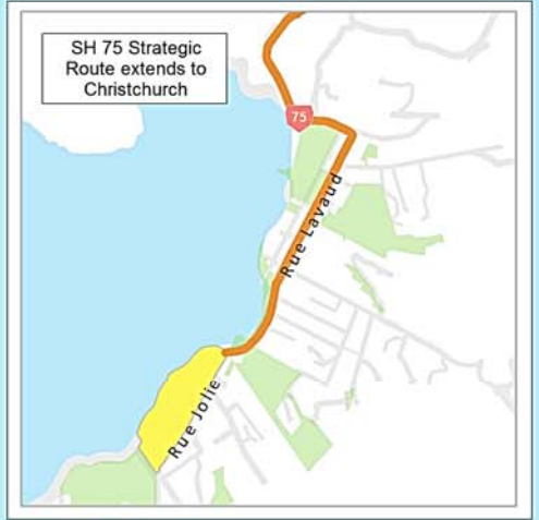
Akaroa. Scale 1:25000

SH 75 Strategic Route extends to Akaroa Township